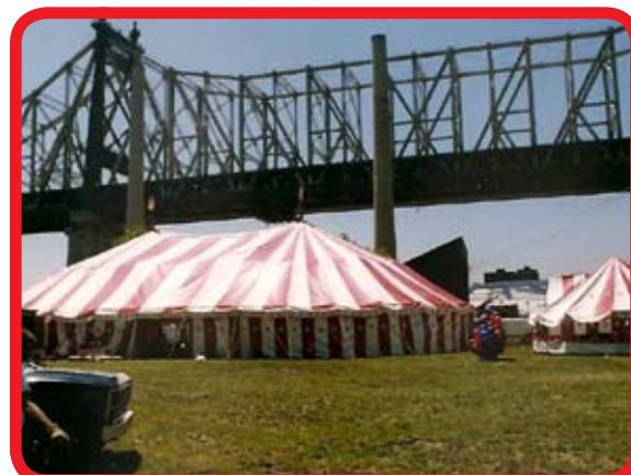
Vidbel circus tent in unusual set up under bridge.