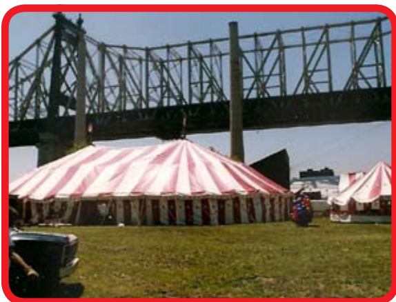
Vidbel circus tent in unusual set up under bridge.